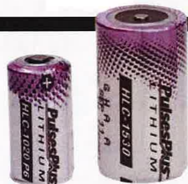
Figure 2: The same power, but smaller form factor: The new HLC-1020 P6 will be able to substitute the HLC-1530A – and more ...

from -40 up to +85 °C. The task was to gather more power capability into a given form factor. Back in 2008 by optimising the surface structure and composition of the inner components it was possible to double the power capability between the HLC A type and the HLC B type. In the meantime, Tadiran's R&D department invested more effort into pushing this system forward. The result is the HLC C type which again provides twice the power of the B type.