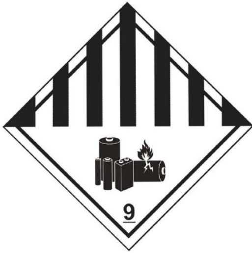
Class 9(A) Hazard Label for lithium batteries