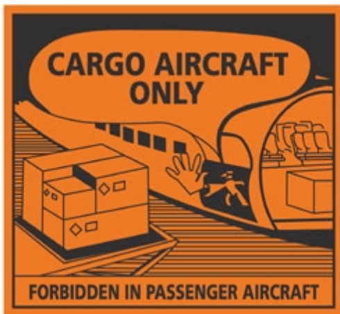
Handling Label Cargo Aircraft Only

Symbol (seven vertical black stripes in upper half; battery group, one broken and emitting flame in lower half); black Background: White